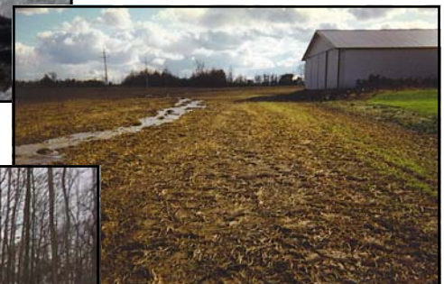
▲ Before Installation